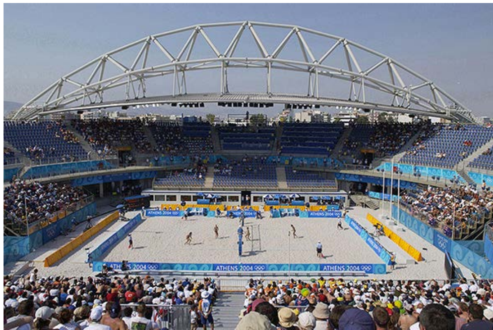
Athens summer Olympics 2004. The beach volleyball venue. The Olympics now anger many Greeks as the country struggles through record unemployment and poverty.