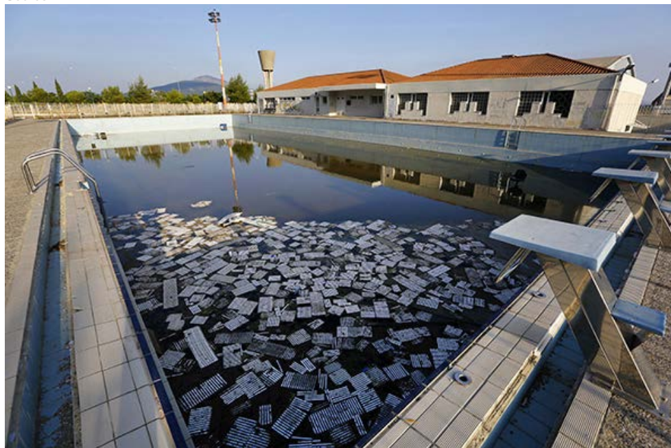
Athens, July 25th 2014. Garbage floats in a deserted swimming pool at the Olympic village. Many of Greece's once-gleaming Olympic venues have been abandoned.