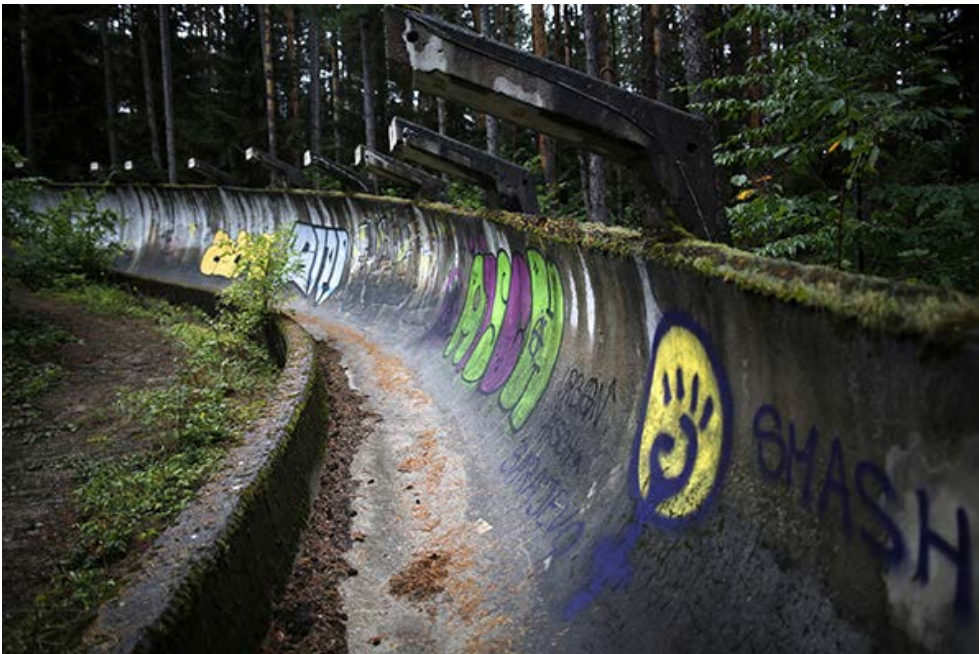
Sarajevo, September 19th 2013. The disused bobsleigh track became a Bosnian-Serb artillery stronghold during the war and now is often the target of vandalism.