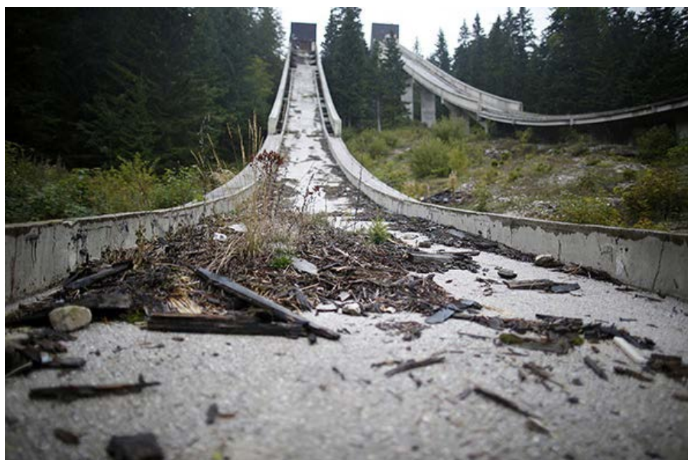
Sarajevo, September 19th 2013. Abandoned ski jump on Mount Igman. Most of the Olympic venues in Sarajevo have been reduced to rubble by neglect and the 1990s conflict.