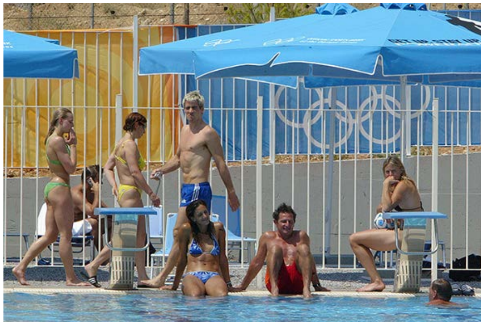
Athens summer Olympics 2004. Athletes and delegation members relax by the pool at the Olympic village.