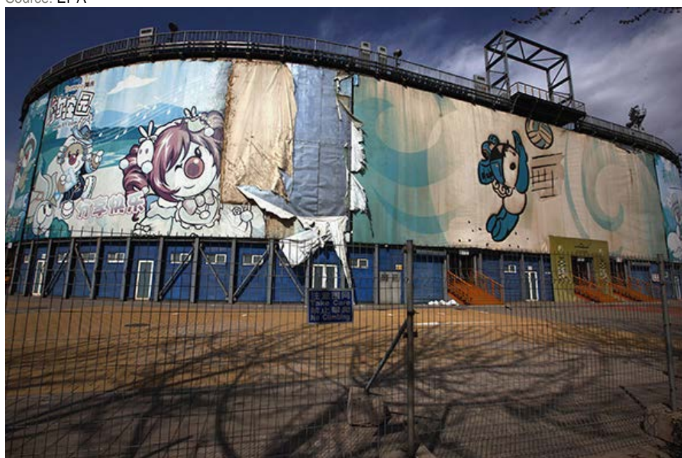
Beijing, April 2nd 2012. The beach volleyball venue. Many venues built for the Olympics have either been left vacant or completely demolished.