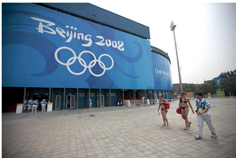
Beijing summer Olympics 2008. Beach volleyball players walk to the Chaoyang Park ground.