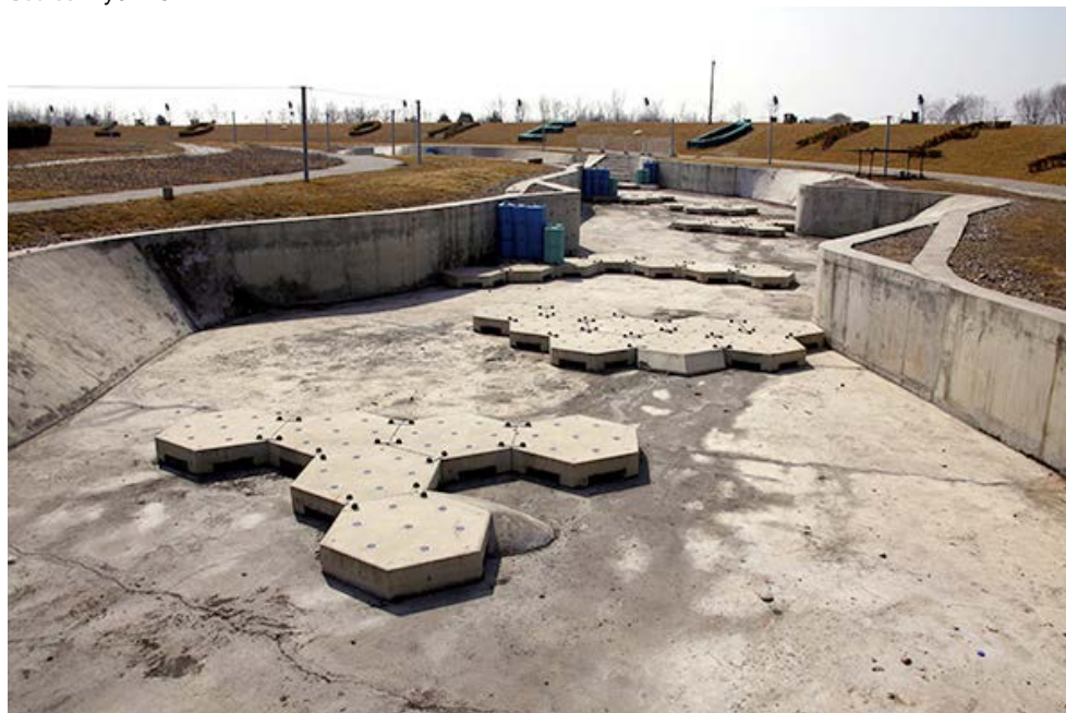
Beijing, March 27th 2012. The unmaintained former venue for the kayaking competition can be seen on the outskirts of the capital.