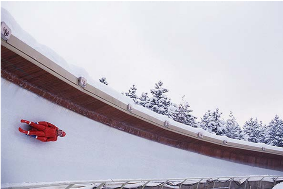
Sarajevo winter Olympics 1984. Two men ride their luge sled down the bobsleigh track.