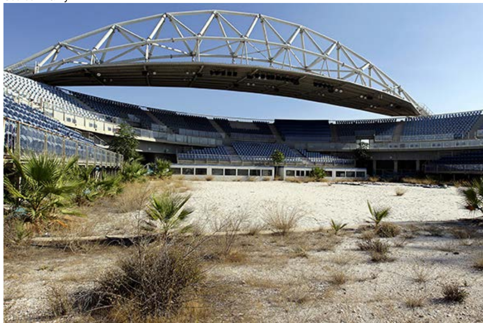
Athens, August 13th 2014. The abandoned beach volleyball stadium. Many believe the Olympics were one of the factors that brought Greece financially to its knees.