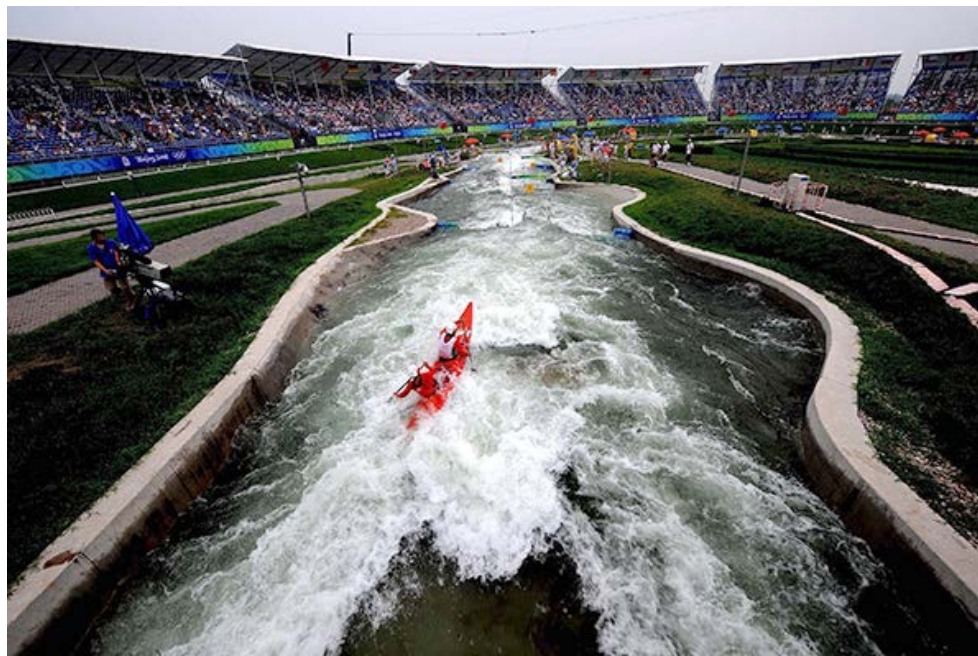
Beijing summer Olympics 2008. The men's canoe double heats of the canoe/ kayak slalom competition.